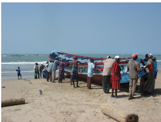
Figure 7: Launch of a new pirogue in the Gambia

Conflicts between the artisanal and industrial sectors have generally decreased in the region, but there is a trend whereby pirogues enter the Exclusive Economic Zones (EEZ) of neighboring countries and then land in their country of origin, demonstrating a transnational aspect of illegality, even within the artisanal sector. There are also accusations that the artisanal sector encroaches into the waters of neighboring countries because it is being pushed out of its own national waters by industrial vessels that infringe and overfish in its IEZ.