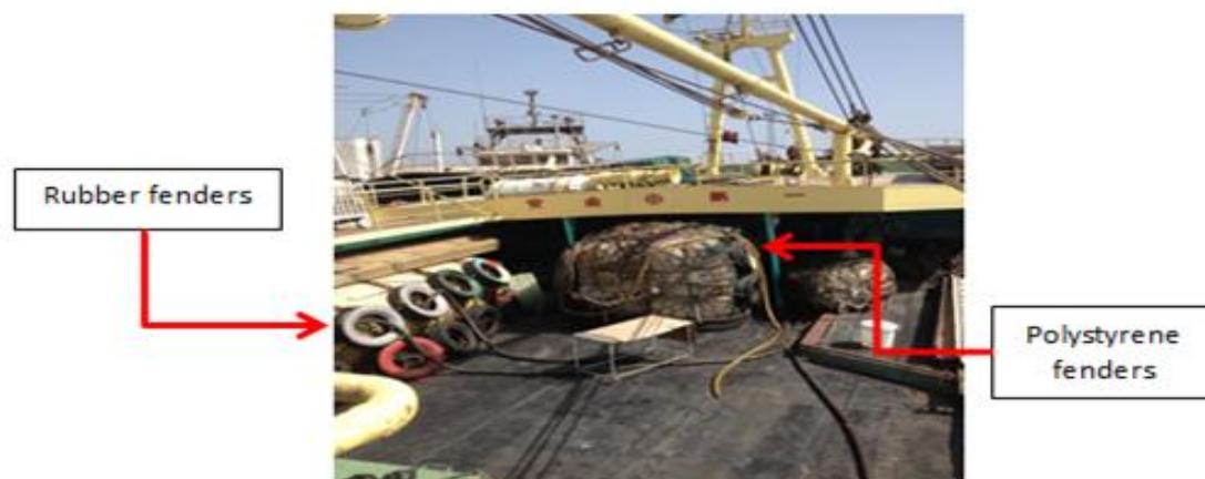
Figure 8: Fenders on board FV Tai Yuan 227, indicative of transhipment activity

The primary evidence for this is the presence of fenders (defence) on the foredeck (see Figure 10 below) which would not normally be on the fishing deck of a longliner. These fenders are to protect vessels from banging against each other whilst transhipping. They also make it easy to transfer crew between vessels.