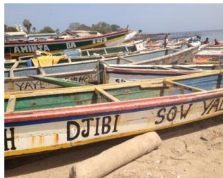
Figure 6: Senegalese pirogues

To avoid these problems, several countries have created Inshore Exclusion Zones, an area along the coast reserved by law for small-scale fishermen, using specific fishing methods and with the aim of conserving fish stocks on which the local communities depend. Well-documented cases exist for several coastal states where the IEZ has been regularly violated by trawlers and the gear of the small-scale fishermen destroyed. In addition, due to the small mesh size of the nets, trawlers catch a very high proportion of juvenile fish which are then discarded. Experts from several coastal states reported significant problems with keeping industrial vessels, especially those trawling for demersal species and shrimp, out of the IEZ.