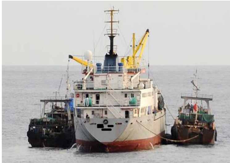
Figure 3: A transshipping operation underway in West African waters between two stern trawlers and a refrigerated fish carrier (reefer). Note the large black fenders (Yokohamas) necessary to prevent the ships from coming into contact with each other. These are carried by the reefer, and their presence on the deck of a reefer indicates that the vessel is likely to engage in transshipping. Black marks on the sides of fishing vessels and reefers are also an indication that fenders have been used and that transshipping may have taken place.

not only represent a fisheries regulatory risk. Out of sight of the authorities, any cargo can be exchanged. Crew members can also easily be moved across vessels, facilitating the occurrence of forced labor at sea. Even when reefer vessels do broadcast vessel tracking information, vessels that come alongside reefers are often not visible to any tracking tools, unlike the reefer whose pattern of behavior in drifting for a few days indicates a risk that undetected and unmonitored vessels have come alongside it. That reefer then has access to secure port facilities and all the logistics of onward supply chains.